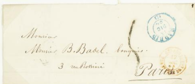
From Madrid To Paris December 13, 1854 Blue MADRID 20mm C.D.S. Red circular ESPAGNE/ST JEAN DE LUZ Dec. 17 Black Paris arrival mark Dec. 18 on reverse