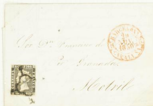
From Barcelona To Motril Nov. 29, 1850 Franked with Spain No. 1 Black Arana (spider) cancel Red BARCELONA/CATLUNA G&T No. 34 type 2 baeza