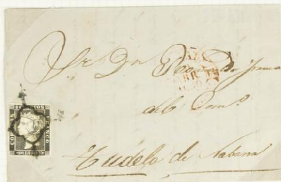
From Valladolid To Tudela April 20, 1850 Franked with Spain No. 1b Black Arana (spider) cancel Red VALLAD. D/CAST. LA V. G&T No. 15 type 1 baeza