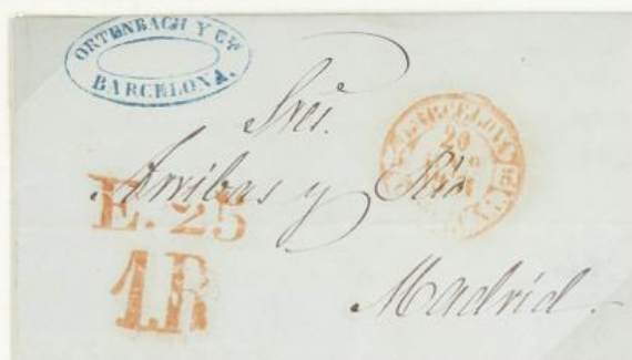
From Barcelona To Madrid January 20, 1851 Red BARCELONA/CATALUNA baeza Red E.25/1R (Jan. 25/1 Real) date & charge mark